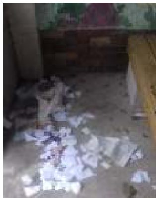
Litter left in Hinnings Road bus shelter!