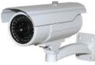
5 New CCTV cameras installed this year.