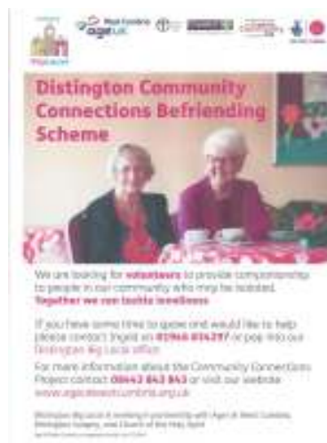
Working with the surgery and Age UK, volunteers needed.