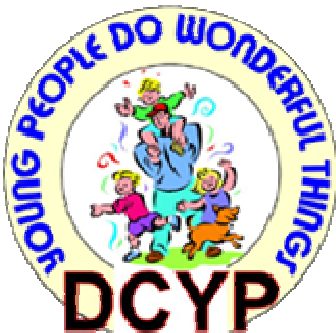
Big Local continues to provide financial support that goes towards the running costs of DCYP