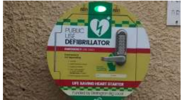
We bought a defibrillator for the village which is located on the outside of the Community Centre