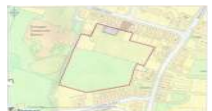
The land we have purchased for the village.