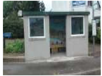
Bus Shelters installed and upgraded.