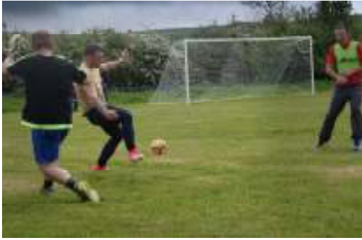
We re-instated the Football Pitch