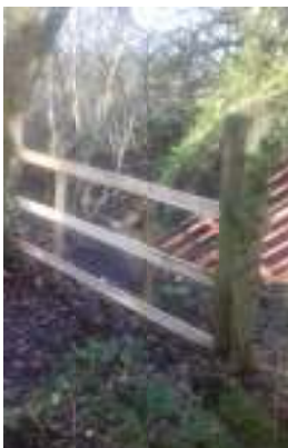
Beck Green Bridge Repair