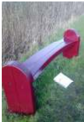
Before and after photos of benches newly painted in the village