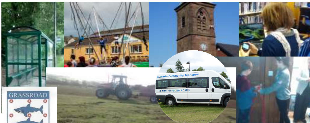
Left to right and top to bottom— new Shelter near Toll Bar roundabout, summer fun day, extra CCTV, digital Club, Grassroads FC, football pitch renovation, transport fund, church toilet and kitchenette (part funded by DBL)