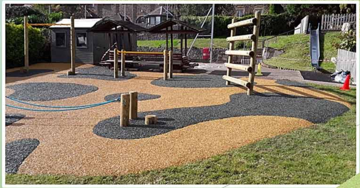
An example of Durabond Surfacing